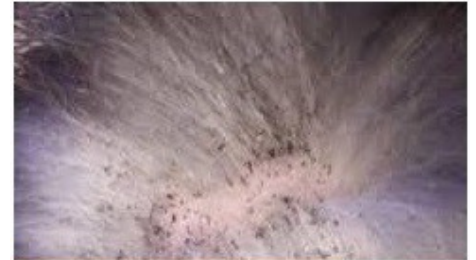
13 Rabbit with Fleas

Coat: Fur in good condition with no bald spots. Nice clear skin with no scabs, cuts or bite marks. No red irritated skin, signs of fleas or fur mites. Rub your hand along the rabbits back feeling for scabs or bumps. If felt check them out. Blow in fur if needed, you need to see the skin.