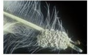
1 Nits (eggs) on a poultry Feather

Mites: Appear as black, gray or red specks depending on if they have fed or not. Red mites are blood Feeders that live in the coop and feed on the bird at night. Northern Fowl mites are black and live on the bird permanently. Mites are hard to spot, they are usually found around the head and under the wings. The Bird will show signs of weak and thirst. You will see scabby face, combs and wattles.