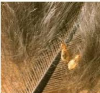
3 Lice on a poultry feather

Lice: Check for lice around the vent, under the wings and on the back of the head about 1 inch from the comb. Look for red irritated skin. Lice feed on the bird's skin scales most of the time red skin = Lice. Pay special attention to the area around the vent this is usually where nits and lice will be found. The most obvious sign is the white Crustaceans attached to the feathers around the vent. They can be found anywhere on the bird but are most commonly found around the vent. These are the lice nits (eggs) they start to hatch at 8 days but can take longer to hatch depending on the environment.