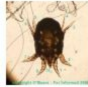
11 Rabbit ear mite

Ears: Clean and Dry and wound free with no signs of ear mites.