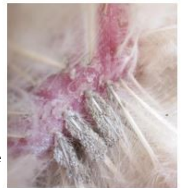
4 Skin Damage caused by Lice