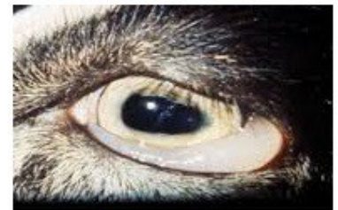
Anemic goat eye membrane is white

Hoofs: Check for hoof rot. They should be shiny and dry and trimmed.