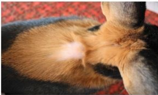
14 Rabbit with Fur Mites

Bottom: Clean and Dry. Nonirritated skin, free of poop clingons. No puss and parts in good condition.