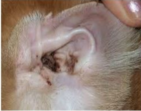
12 Rabbit with ear mites